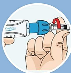
Fix the nozzle into injector by screwing