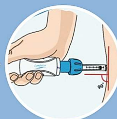
Positioning 90 degree angle