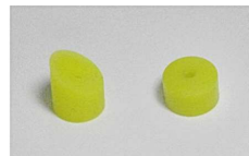
POSITIONING CAPS (TYPE 01 & 02)