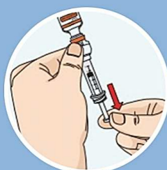
Fill the nozzle (syringe)