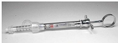
AD-DENTAL (DENTAL ADAPTER)

<Recommendable accessories of Comfort-in™ for dental use>