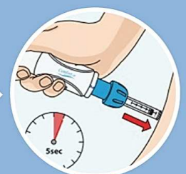
Injection & maintain 5 seconds.